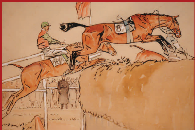
Heartbreak Hill, Paul Brown

NAMOS is pleased to support education efforts. Please call 317.274.3627 for a tour.