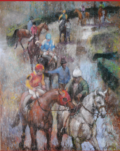
Post at Belmont, Fay Moore

We will keep you updated on the upcoming exhibit and events surrounding the Football Invitational .